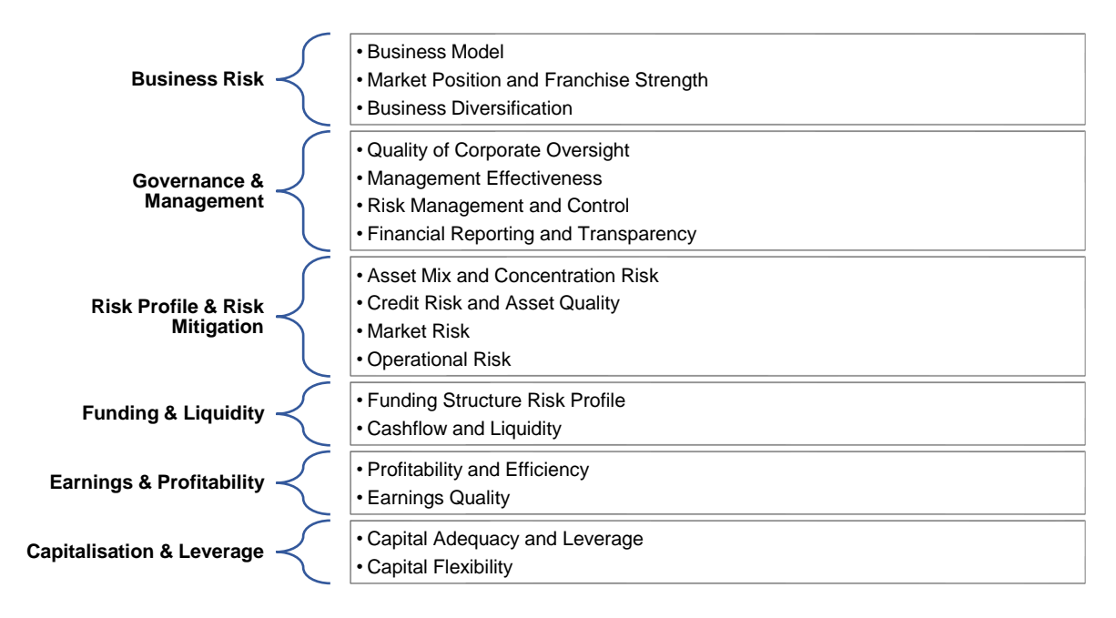
BOX 2: ANALYTICAL PILLARS OF BFRA

The principal characteristics of each key rating factor by assessment category ('very strong', 'strong' etc) are tabulated in each of the report sections below. These 'key characteristics' tables are offered for guidance. They do not constitute a checklist and are not exhaustive. Some, but not necessarily all of the characteristics of a particular assessment category may apply to the rated NBFI and there may be cases where the NBFI is best described by attributes from a combination of assessment categories. It is ultimately for the rating committee to determine which category fits best.